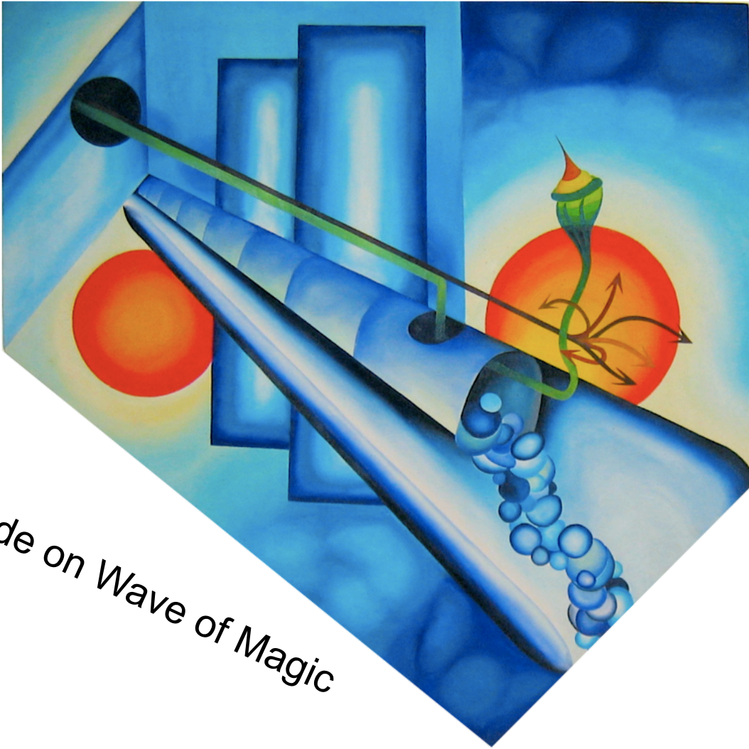
Ride on Wave of Magic