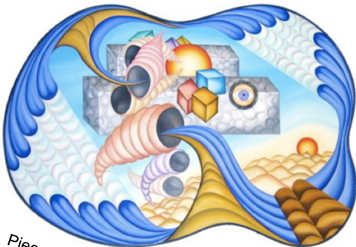
Piece of Mind