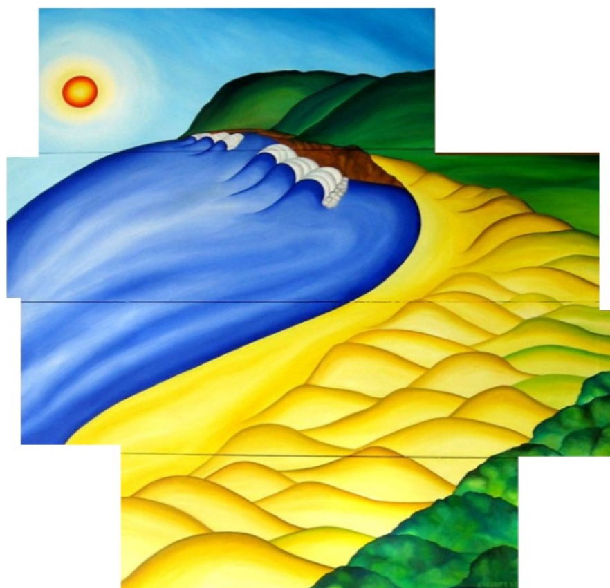
View 3 - South Dudley